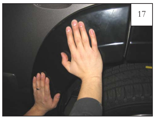
Apply firm pressure to taped areas for proper bond. Tape reaches maximum adhesive bond after 24 hours of contact. Do not wash vehicle until 24 hours have passed.