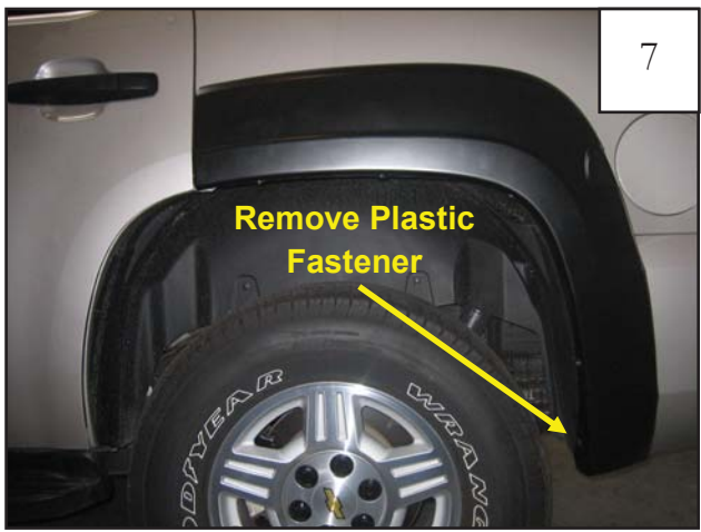
Using a flat head screw driver, remove one factory plastic retainer and discard.