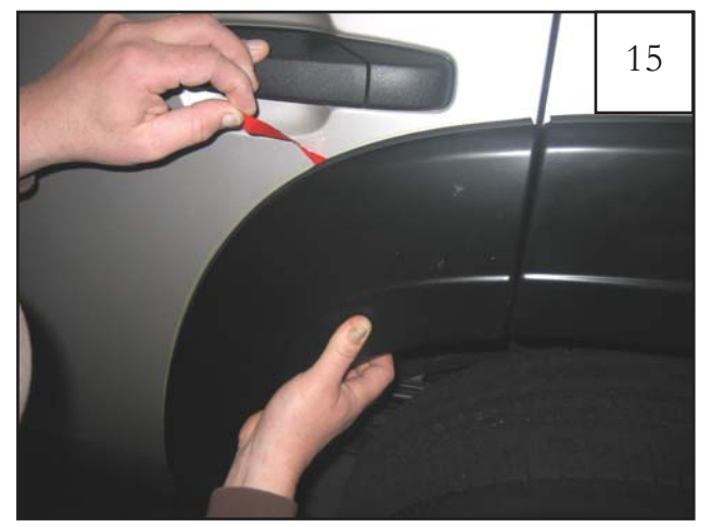
Confirm placement of the part. Gently pull the tape liner from the tape, starting with the top tab you created.