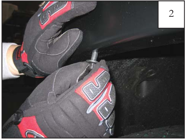
Holding flare in position on fender, install two supplied Plastic Push Retainers.