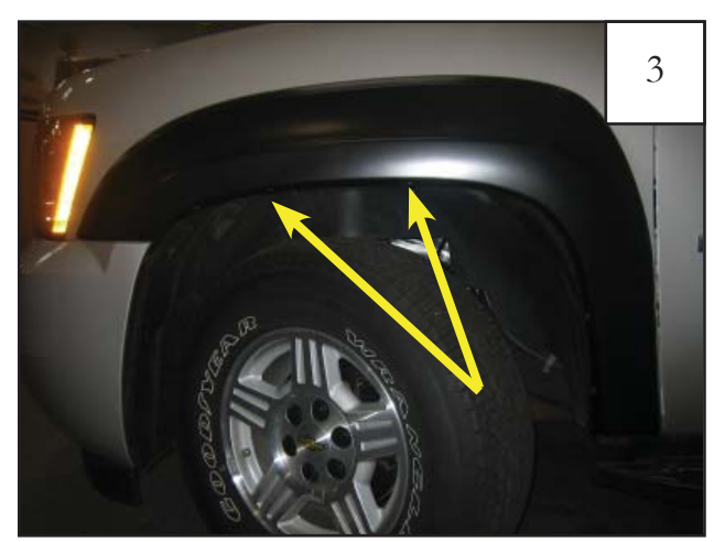
Plastic Push Retainer locations.