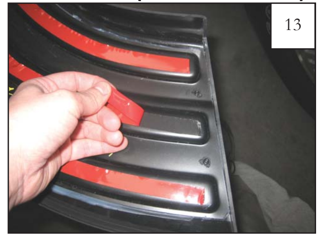
Peel the red liner entirely from the CENTER tape pad. Peel 2" of liner from each of the other two tape pads, folding out to form tabs.