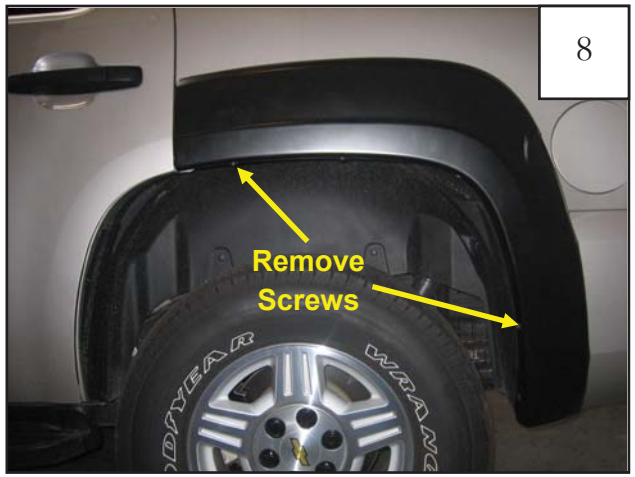
Using a 9/32" socket, remove two factory screws. Retain screws for later use.