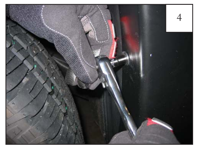
Reinstall factory screws removed in Step 1.