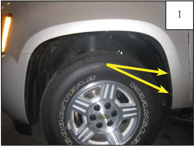
Using a 9/32" socket, remove two factory screws. Retain screws for later use.