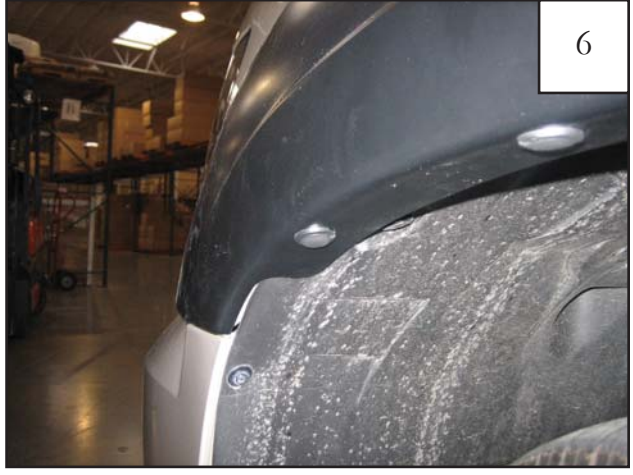
Install a supplied Plastic Push Retainer through forward hole in flare.

Using hole located in forward portion of flare as a guide, drill through the splash shield with a 5/16" bit. Holes in flare and splash shield should align with factory hole located in fender.