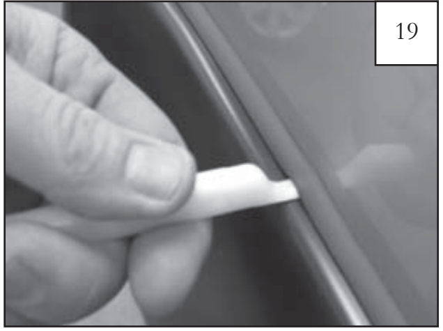
Using flat end of supplied Edge Trim Tool, seat edge trim against flare by inserting straight end between edge trim and flare at one end. Next, slide around entire edge to the other end.