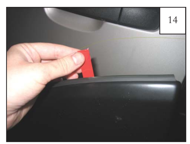
Hold the part at an angle to prevent tape from prematurely sticking, and align part on the door. Make sure liner is protruding from part for ease of removal.