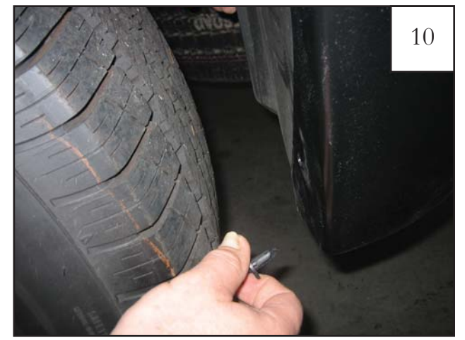
Install three supplied Plastic Push Retainers in remaining holes in flare.