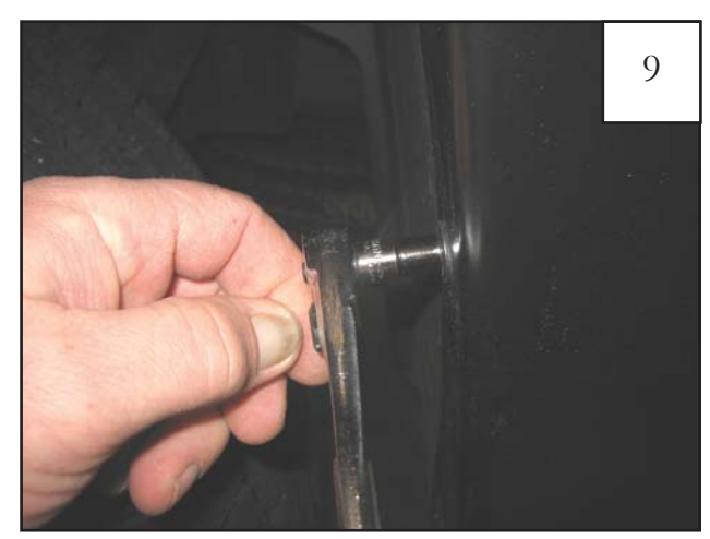
Holding flare in position on fender, reinstall factory screws removed in Step 8.