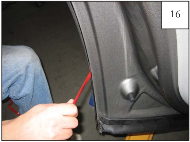
Open the door and gently pull the bottom tape tab you created.