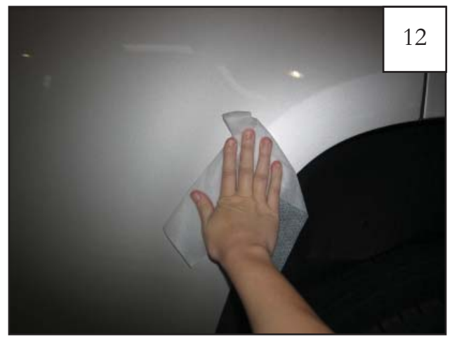
Using a supplied alcohol wipe, clean the area where the door piece will be installed.